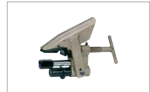
Clamp for alloy rims 4021852