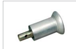
Mounting roll for tubeless tyres 4022287