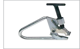
Clamp for steel rims