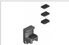
Additional clamping jaws for alloy rims (4 each) 4030013