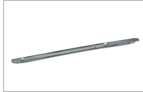
Short tyre lever