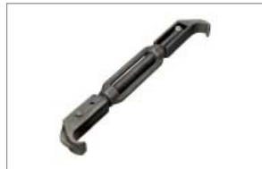
OTR extension for spit-ring rims 4007611