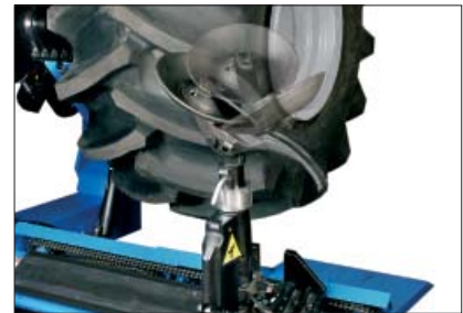
The mounting tool is adjustable by 180 deg. irrespective of arm position.

This power package can be used to change tyres on rims of 4" to 58" outside diameter.